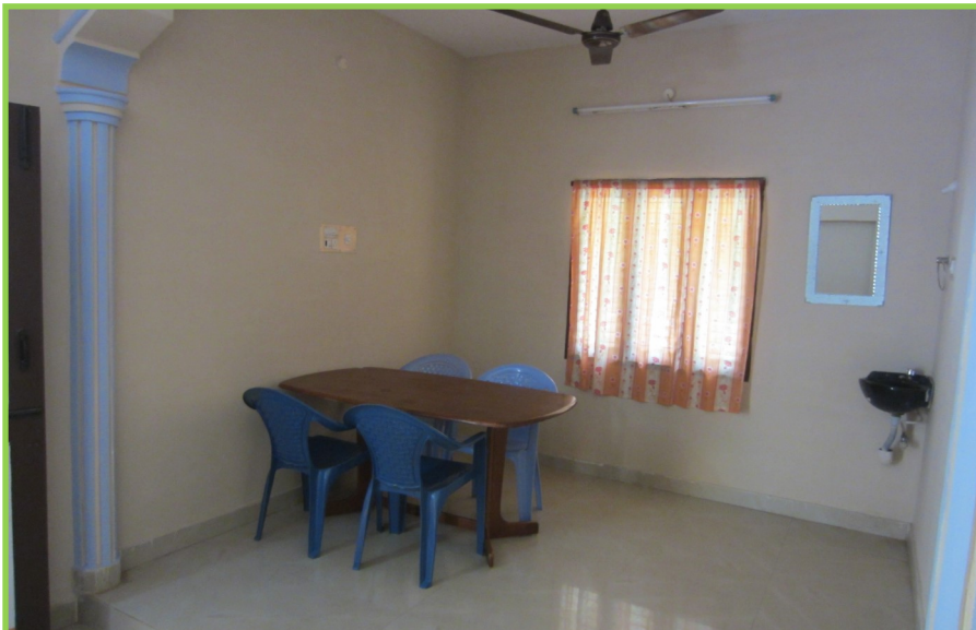
Oonjal Veedu Ground Floor Dinning Hall