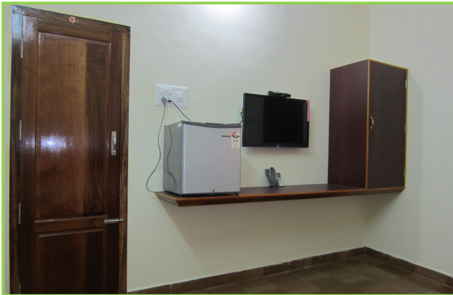
Oonjal Veedu Extension with MiniBar /LEDTV with Videocon DTH