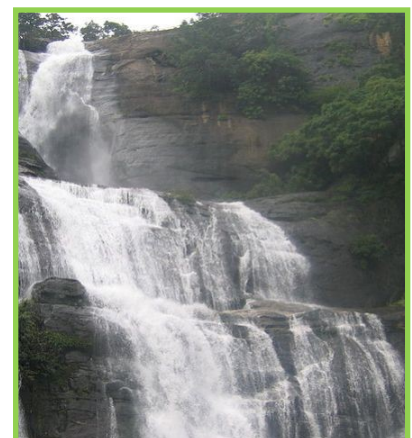
Walkable Distance to Main Falls

Dial us : +91-9962655606 | +91-9486934499 | +91-9487261564