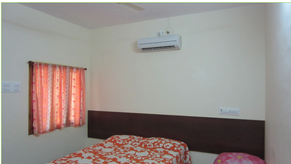
Extension Room with OG Air Conditioner